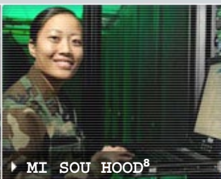
▶ MI SOU HOOD 8